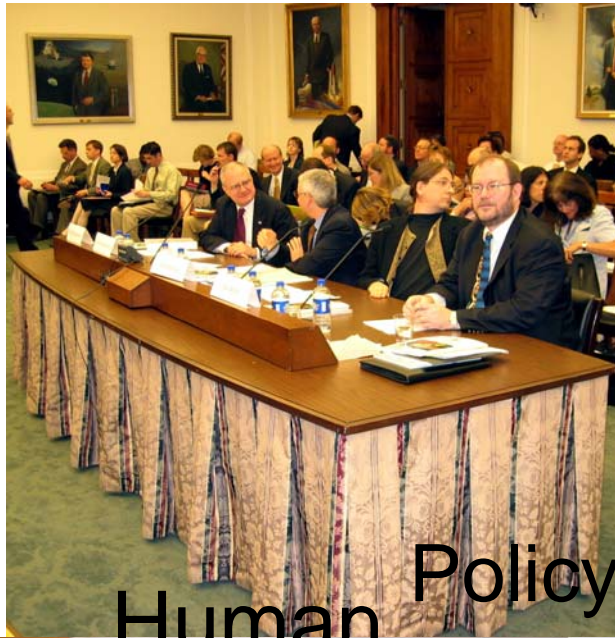
Policy Human Resources